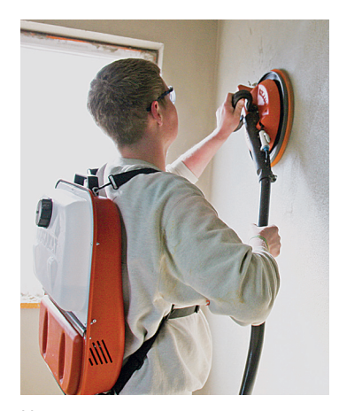
No extra water supply needed