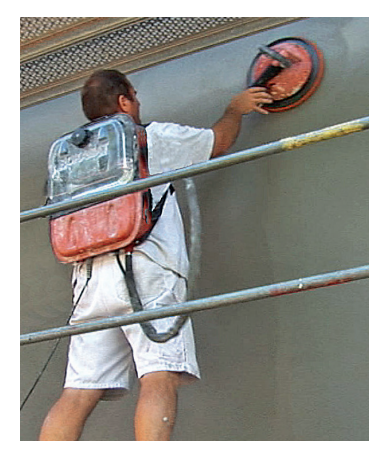
Easy working on scaffolding